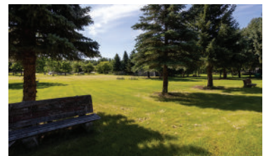
Manor Estates II