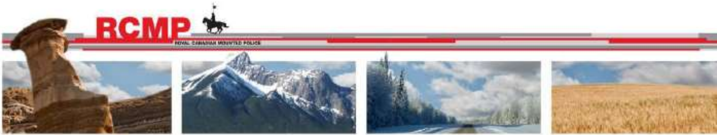
Provincial Police Service Composition Table 2