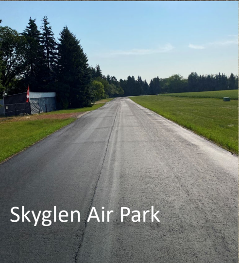
Skyglen Air Park