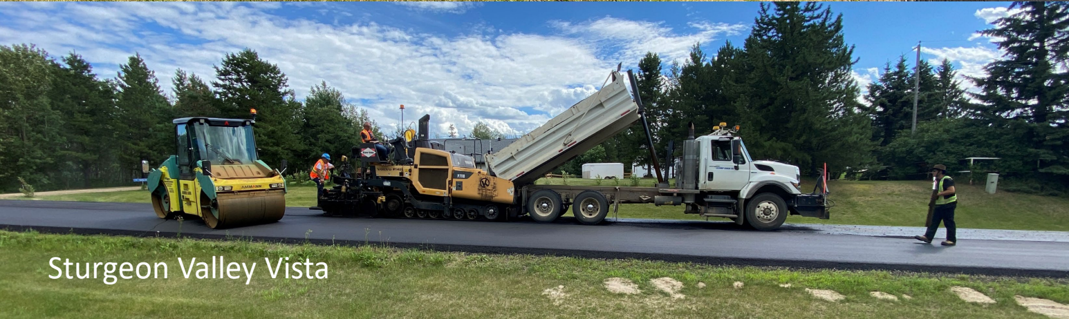
Sturgeon Valley Vista