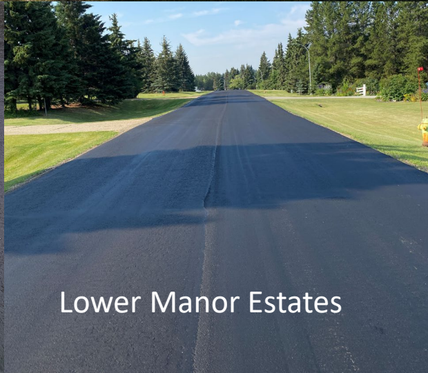
Lower Manor Estates