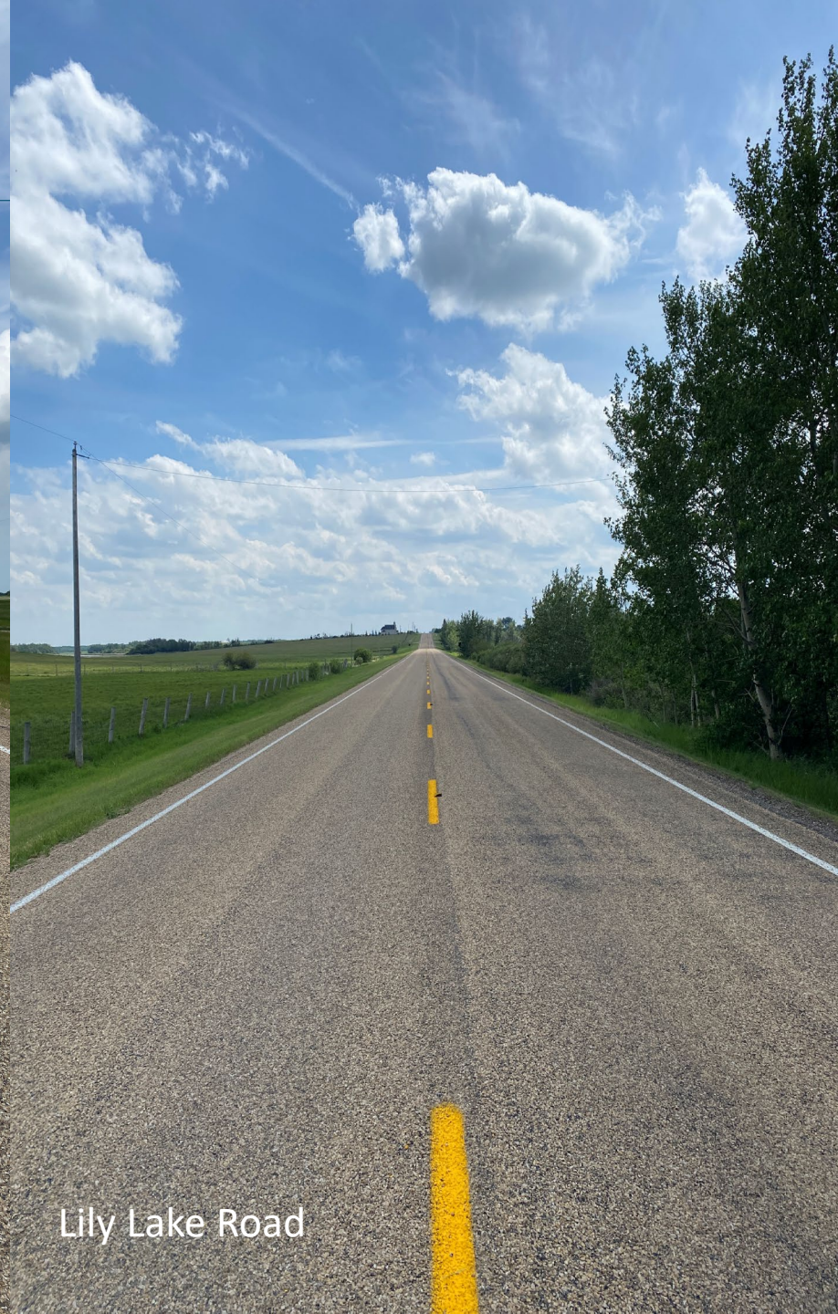
Lily Lake Road